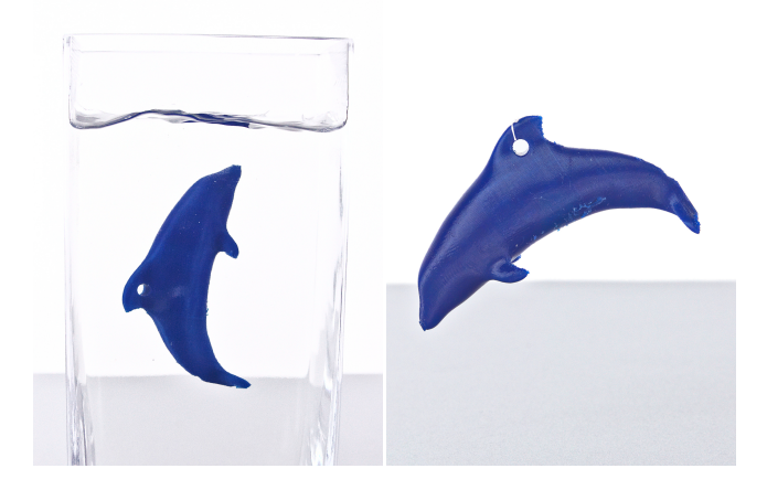
Figure 7: The Dolphin combines a full immersion objective (left) with a suspension (right).