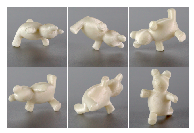
Figure 6: Using only two capsules we can optimize the Breakdancing Teddy to stand steadily in six surprising orientations.

Romain Prévost and Moritz Bächer and Wojciech Jarosz and Olga Sorkine-Hornung / Balancing 3D Models with Movable Masses