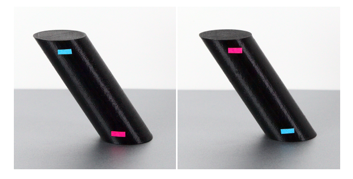
Figure 2: The Sheared Cylinder can only balance on both its ends with an embedded movable mass, because a single center of mass cannot project inside both support polygons.

Romain Prévost and Moritz Bächer and Wojciech Jarosz and Olga Sorkine-Hornung / Balancing 3D Models with Movable Masses