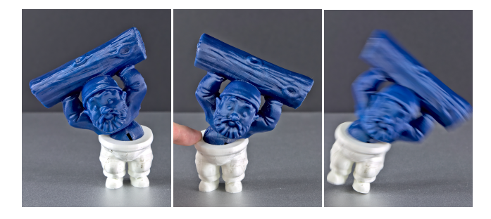
Figure 8: The Muscle Gnome is an example of an articulated model. Though the two poses look symmetric, the model stands stable when brought into the left-tiled pose but tipples over in the right-tilted pose.

points: firstly, already a single capsule leads to significant improvements in stability compared to only optimizing the infill. The latter leads to a tolerance of less than a degree for a tilted ground plane – a value clearly insufficient when taking manufacturing imprecisions into account. Secondly, our heuristic provides near-optimal solutions within seconds. For the exhaustive search we use 360 random sets for each considered number of capsules. Our solutions get close to the optimal toppling angles found by the exhaustive search, implying that our heuristic provides a scalable alternative with a high success rate.