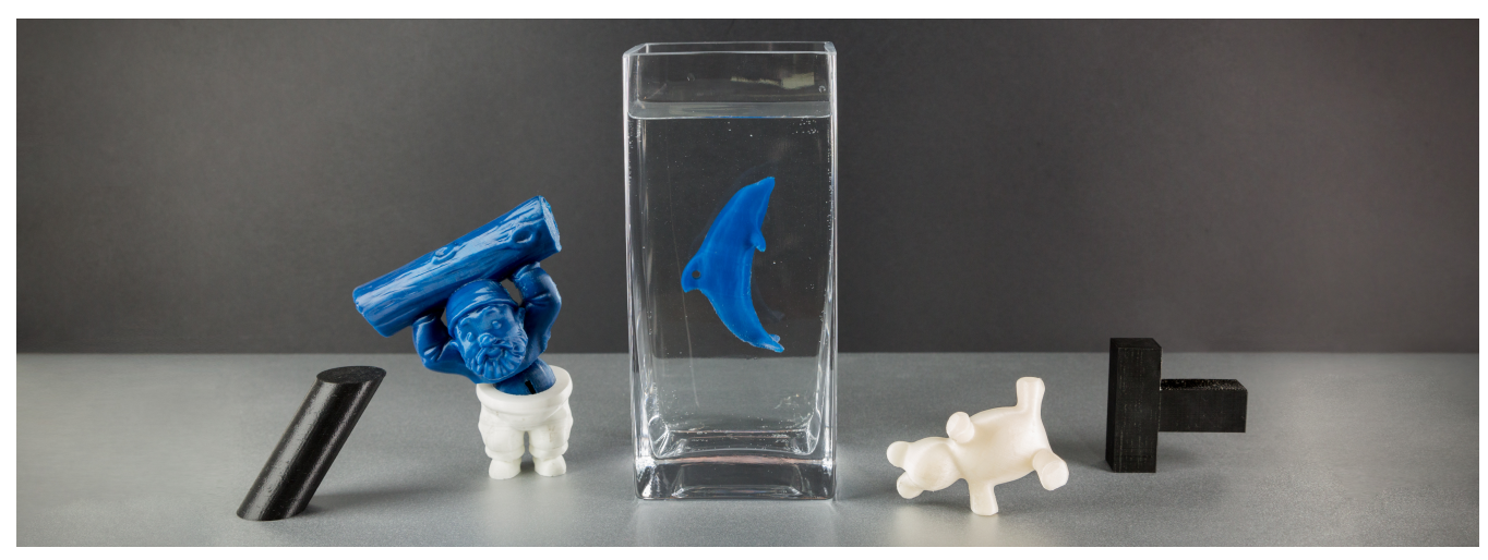
Figure 1: (From left to right) The Sheared Cylinder, the Muscle Gnome, the Dolphin, the Breakdancing Teddy, and the T Shape are all models whose complex balance is made possible by using movable masses and optimization with our method.